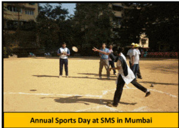
Annual Sports Day at SMS in Mumbai

The Annual Sports Days at the Santa Cruz (W) Municipal School (SMS) and at Aseema's Education Centre for Tribal Children in Igatpuri were momentous occasions for both the students and their parents. Younger children enjoyed participating in fun sporting events that challenged their coordination and motor skills while the older ones displayed their athleticism and team work. Five students from our Mumbai Centres also participated in the Junior National Selection Judo Competition, of which two students bagged gold medals.