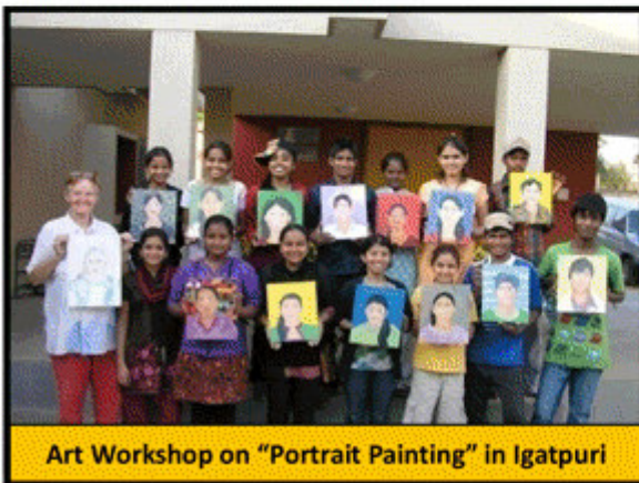
Art Workshop on "Portrait Painting" in Igatpuri

runners for their enthusiasm and commitment at the Marathon. The spirit of giving continued with Valentine's Day fundraisers at Moët Hennessy India Private Limited and Nivea India. Our friends at Café Mocha, G.E., Hotel Sahara Star, Jet Airways, St. Anthony's Road Residents' Association and Tech Mahindra Limited also added gaiety to the celebrations on Children's Day and Christmas. Our children were most excited to be invited to ride in an aeroplane at the Fantasy Flight, participate in games and get delicious snack boxes. Many thanks also to the students from Dhirubhai Ambani International School, N.M. College, Oberoi International School, the Rotaract Club of Fr. Conceicao Rodrigues College of Engineering, the Trinity High School, U.K. and Usha Mittal Institute of Technology for organizing fundraising and awareness drives for Aseema.