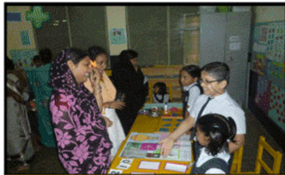
Annual Exhibition of students' work at KMS

A new year with new beginnings – At the 1 st Annual Exhibition at the Kherwadi Municipal School (KMS) in Bandra East, Aseema children had an opportunity to showcase all that they had learnt this year. From skits on the evolution of life to mathematical games and judo displays - the children were most excited to explain what they knew. Another joyous occasion for KMS was that one of their students secured 1 st place at the Inter-school Drawing Competition held by the Municipal Corporation of Greater Mumbai (MCGM).