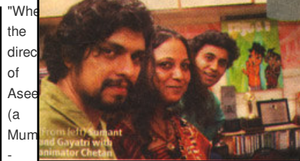
"When the director of Aseema (a Mumbai-based