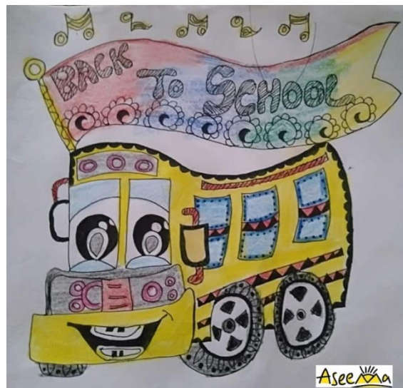
Sketch by Dipika Kanojia Standard X

Back to School with a difference! And how.....! Experiences from our teachers -