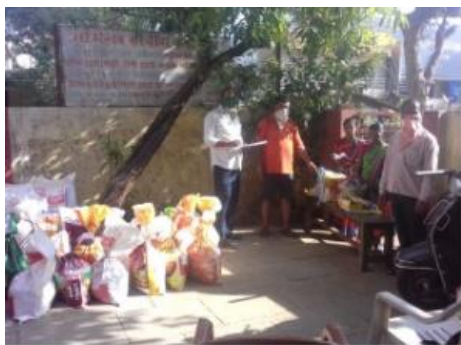
Ration kits for distribution - Igatpuri

The Head of Aseema's Community Work Center (CWC) has this to share, "Most of our parents are daily wage workers who had to stay home with minimal savings and little certainty of the future. Most of their problems could not be solved overnight.