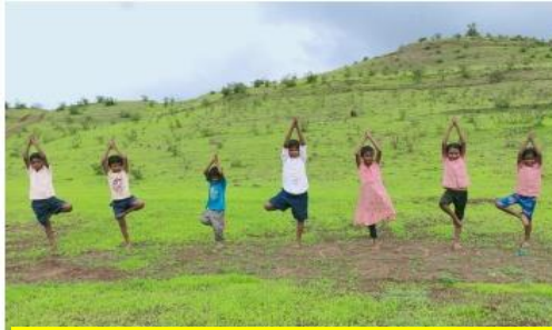
International Yoga Day June 21 - Igatpuri