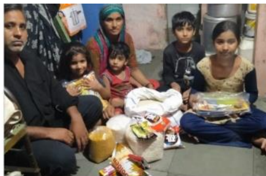
Family with ration & Stationery kits - Mumbai

To protect them from hunger, we estimated that we would require 1800 grocery kits across Mumbai and Igatpuri. Procurement of provisions was a challenge as the