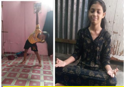
PE and Yoga Day June 21 - Mumbai