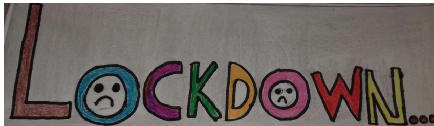
Art- Child's feeling about the lockdown

At the beginning of March 2020 little did we even imagine that we would be in a lockdown for so long. The impact it has had on our children and their families has been traumatic. Almost all of