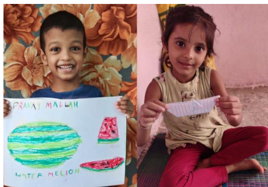
Drawing and Craft classes at home

One teacher shared, “Teaching remotely is a completely different experience. It requires thorough planning where each concept is made simple so that students understand easily.”