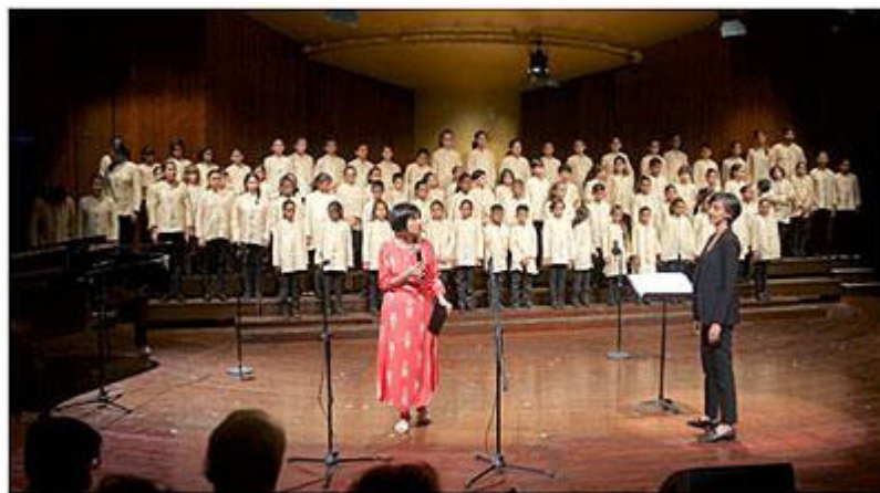
The Pali Chimbai Municipal School Choir with the MMMF Middle Choir

Our children enjoy and learn music with the Mehli Mehta Music Foundation (MMMMF). This enables them to soar beyond the boundaries of their minds and imagination, bringing joy to everyone and themselves. On 27 August, 31 students from Pali Chimbai Municipal School were part of the Singing Tree Concert. Their angelic voices kept the audience enthralled with their rendition of 'Yaaron' and 'Circle of Life' from 'The Lion King', with the other choirs in the finale. Proud parents attended the concert to listen to their children perform on stage at the National Centre for the Performing Arts (NCPA) in Mumbai.